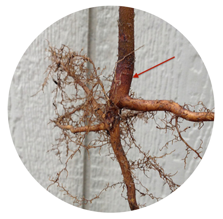
Figure 2. Note the color change between the root and the trunk. Plant the tree no deeper than this mark.

Spread the roots out and slowly backfill the hole around the roots. Gently tamp down the soil around the roots to remove any air pockets. Water the tree deeply. In the absence of rain, water it deeply every 10 to 14 days.